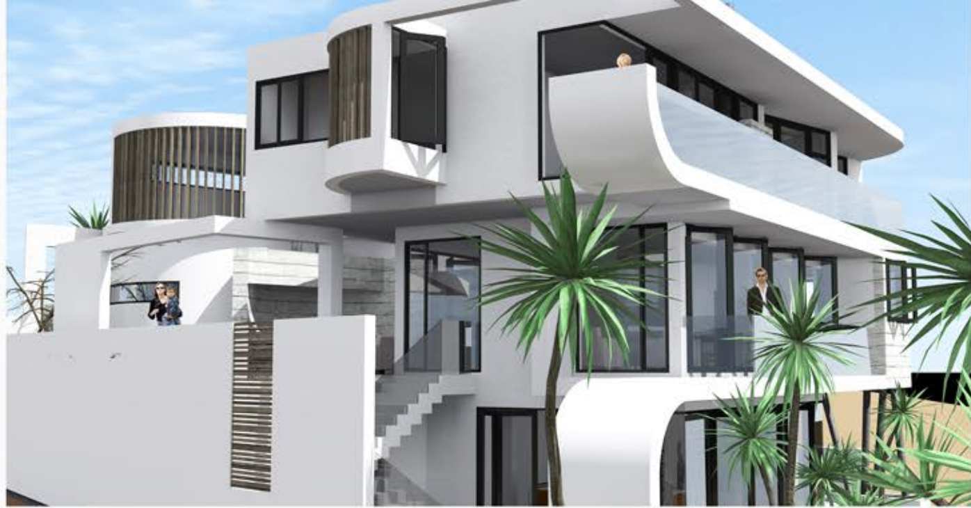
HOUSE NECHVILE AFRODITE BEACH SINGLE RESIDENTIAL (680m²)