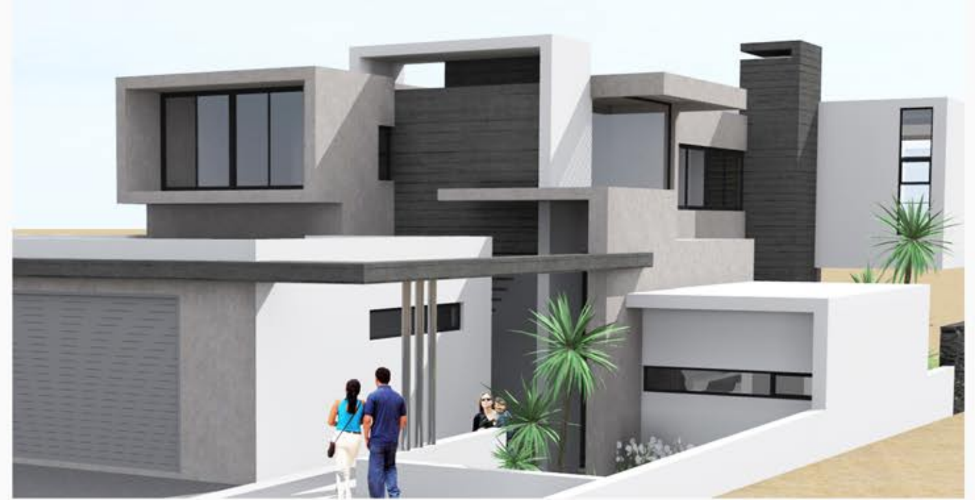
HOUSE THOMAS DOLPHIN BEACH SINGLE RESIDENTIAL (445m²)