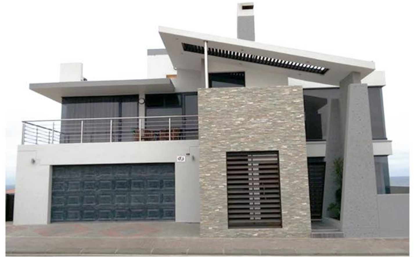
HOUSE KLYNSMIDT LONG BEACH SINGLE RESIDENTIAL (520m²)