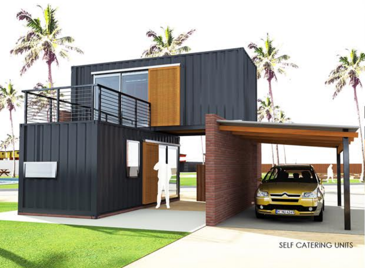
SELF CATERING UNITS