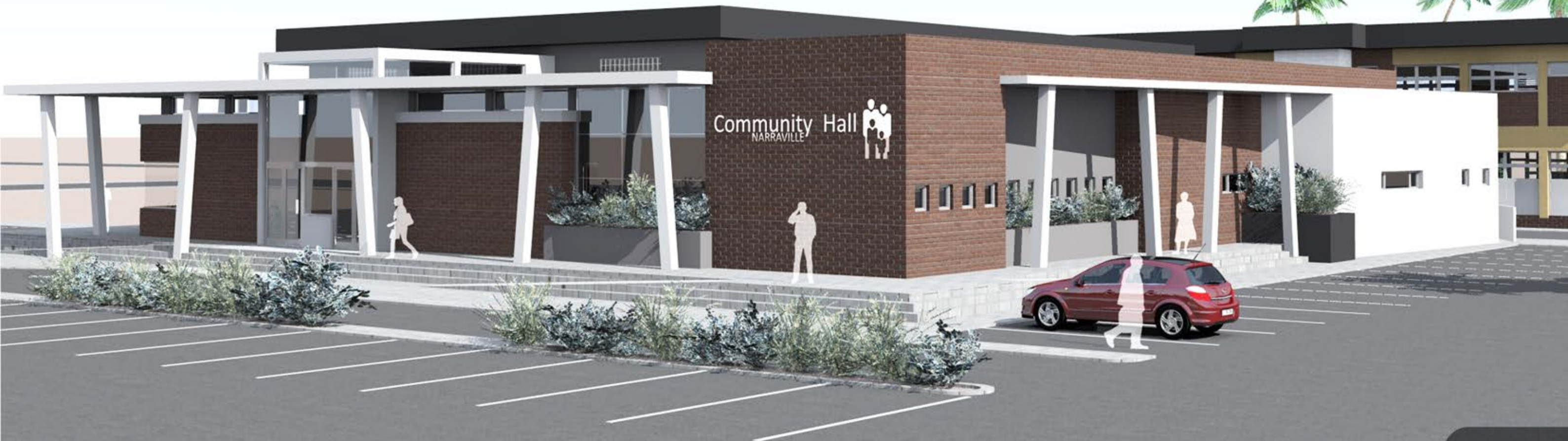
NARRAVILLE COMMUNITY HALL (1300m²)