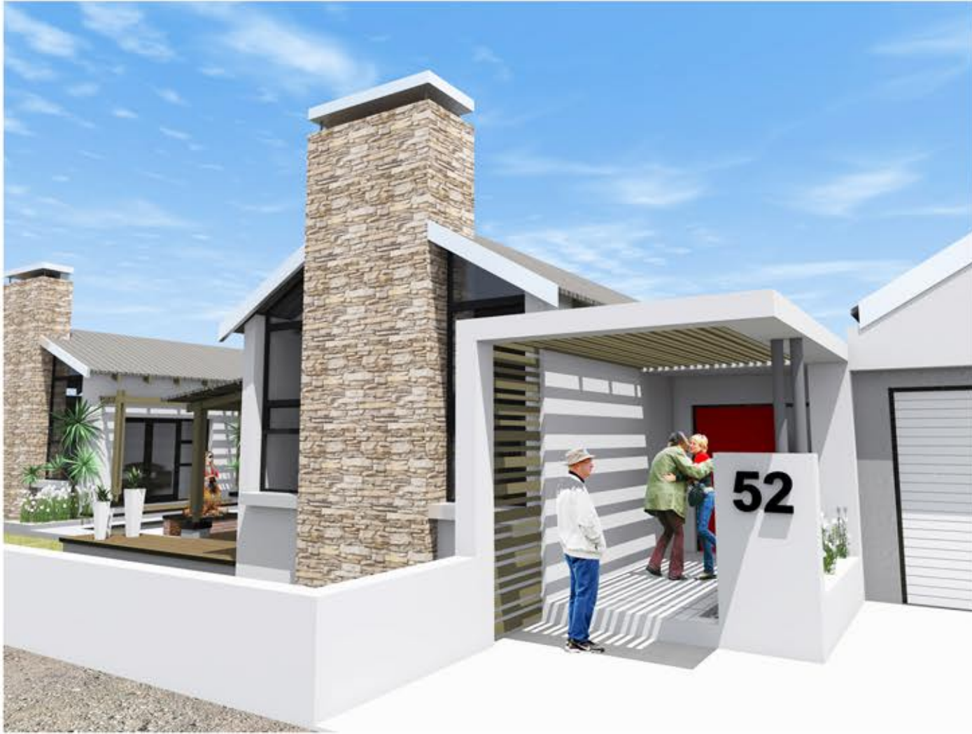
HOUSE KOK WALVISBAY SINGLE RESIDENTIAL (290m²)