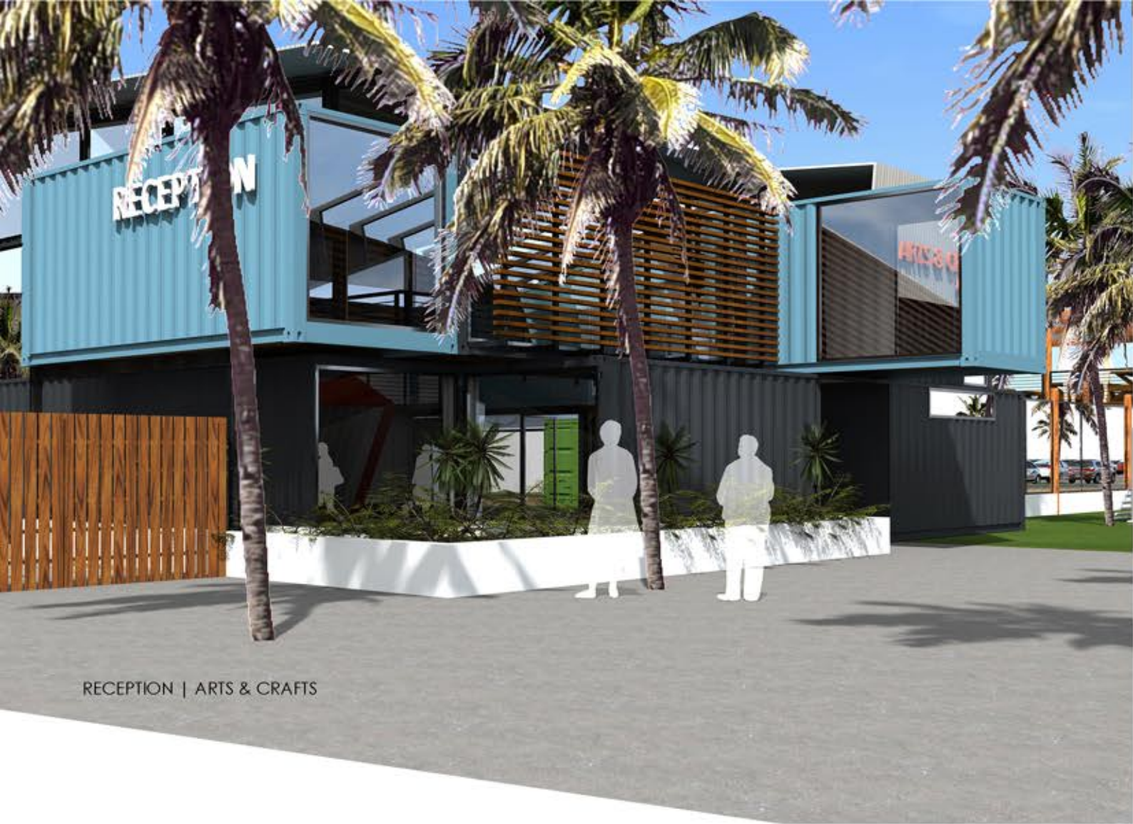
RECEPTION | ARTS & CRAFTS