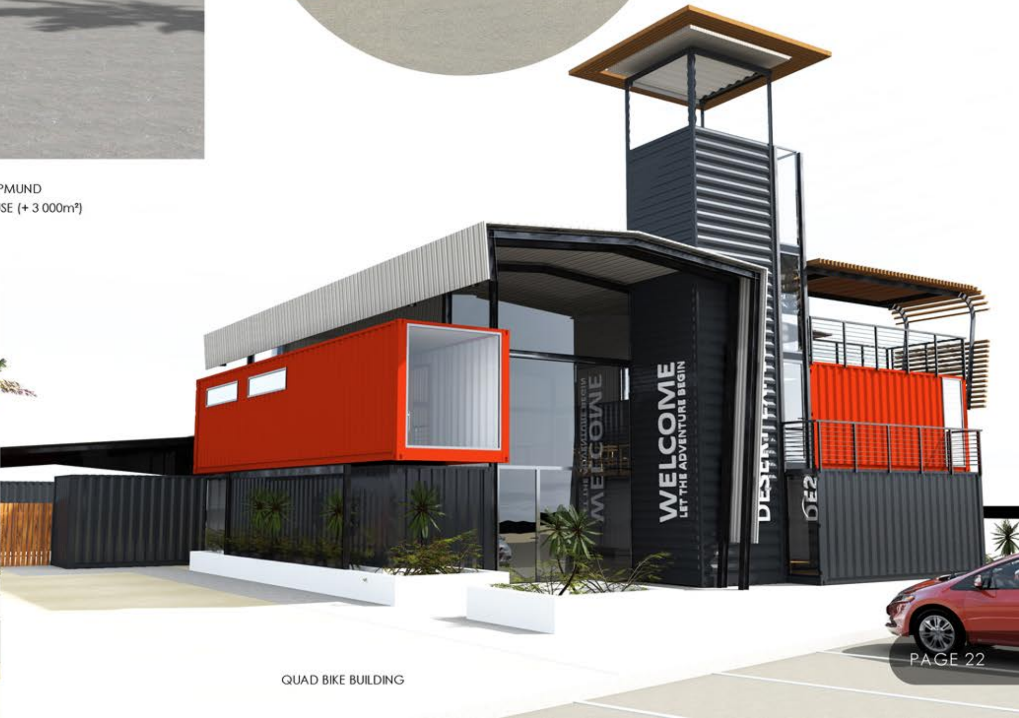
QUAD BIKE BUILDING